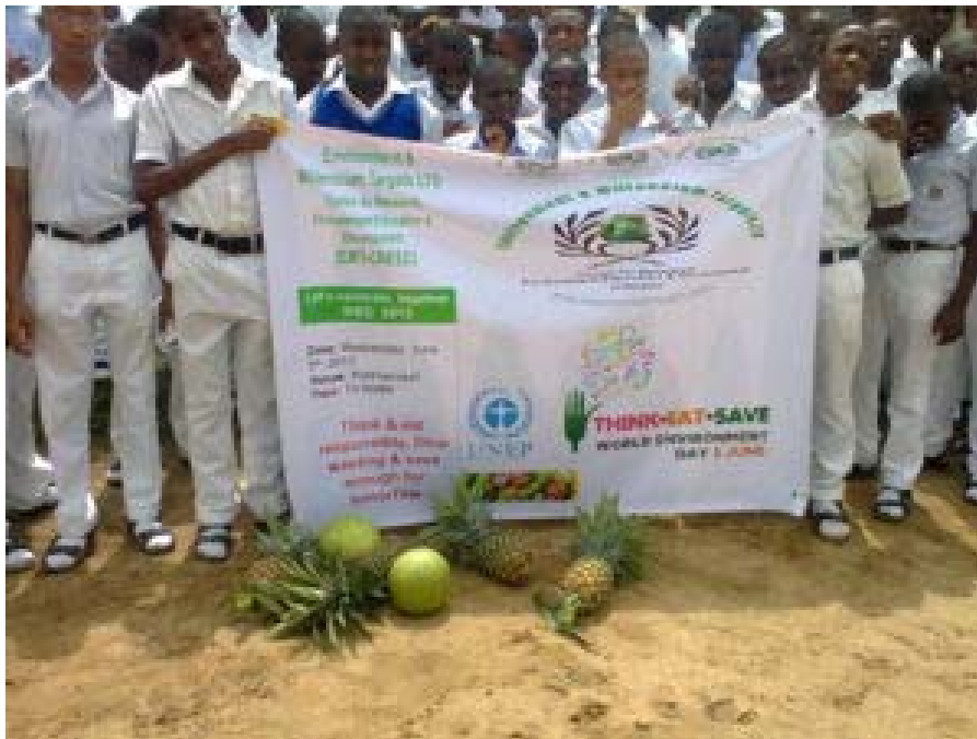
WED @ Sacred Heart Seminary -SHS, 2013