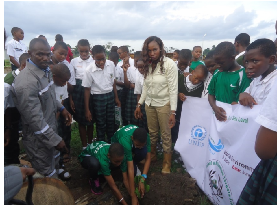
WED @ Jesuits Memorial College , 2014 and Inauguration of HABITAT Club with symbolic tree planting